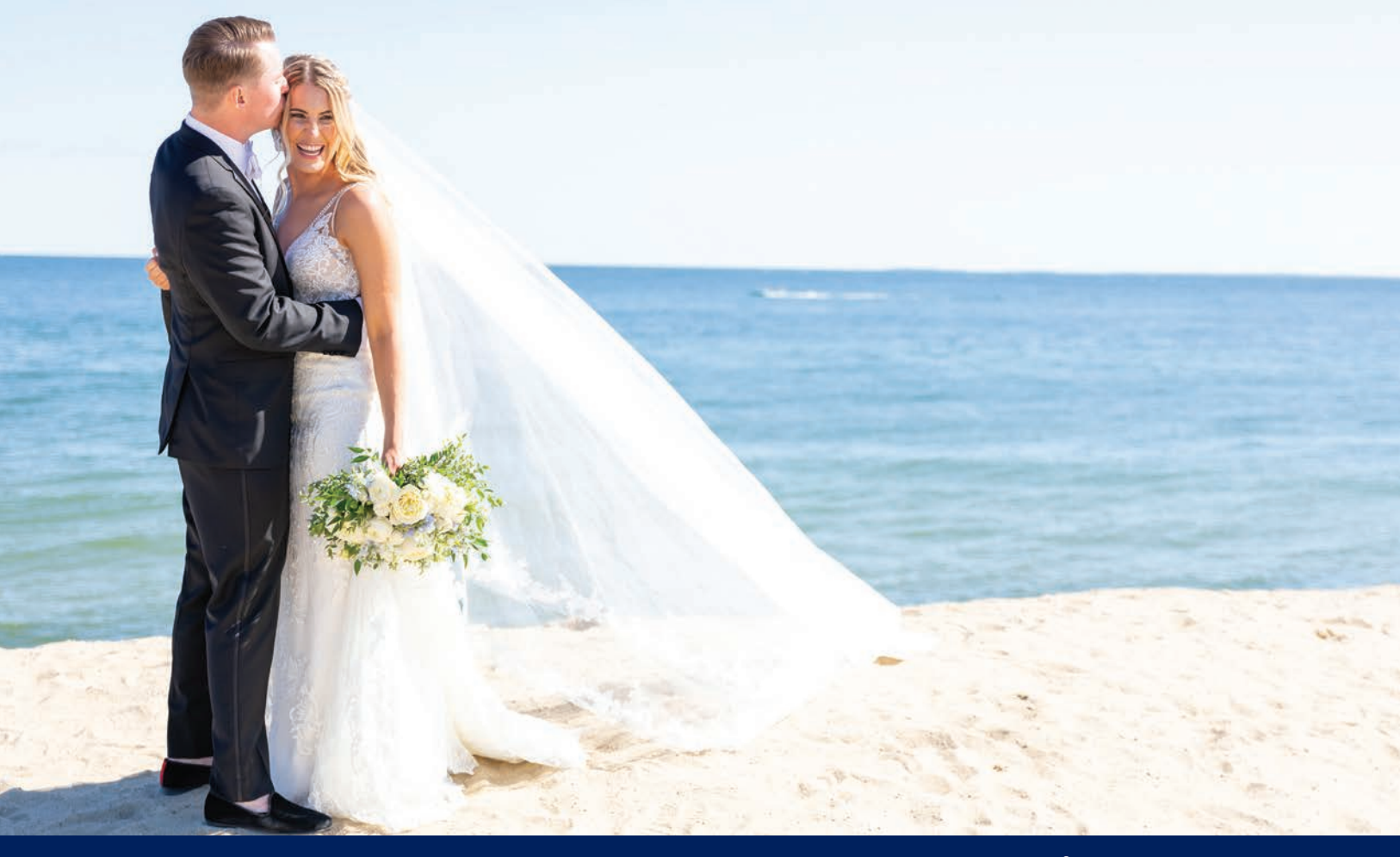
Weddings by the Sea & the Tee...